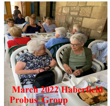
March 2022 Haberfield Probus Group