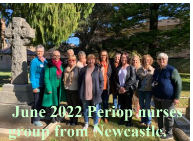
June 2022 Periop nurses group from Newcastle