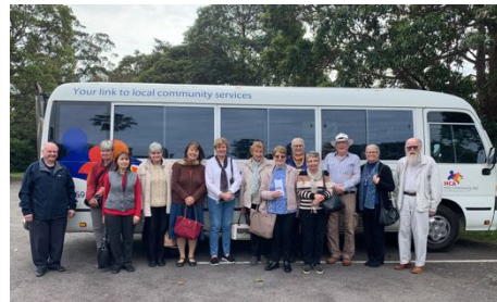
2022 Baulkham Hills Bus Group