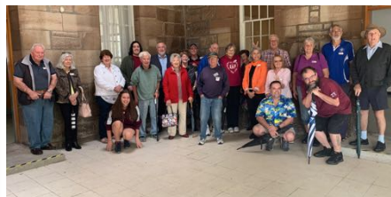
2022 Antique and Classic Motor Club