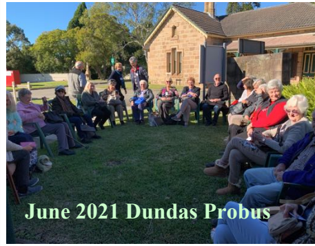
June 2021 Dundas Probus

The Gladesville room The staff bundy clock, and religious artifacts used at Gladesville during services: a very old bible; church organ & pew. There are photographs and some stories about past patients and attendants, as well as literature about the past history of the asylum, Including the Ryde Historical book about the burial site at the museum.