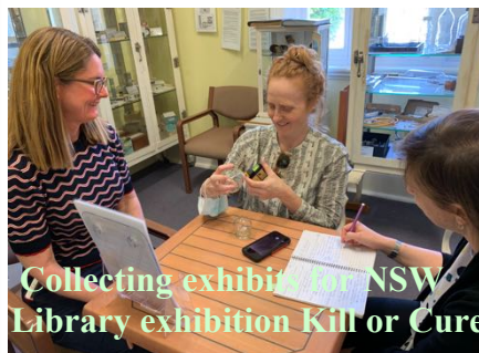
Collecting exhibit for NSW Library exhibition Kill or Cure