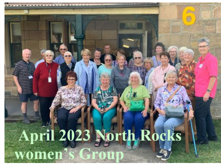
April 2023 North Rocks women's Group