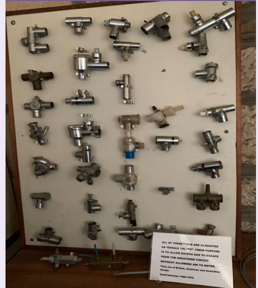
The display of “exhale valves” - currently unnamed.

Attendance at a Health Care Museum such as SPASM allows visitors to reflect on the past, to contrast with the present and contemplate the future.