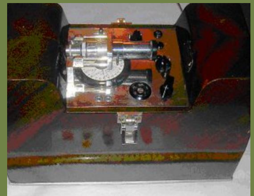
Earlier (1930s) and later "Both" ECG machines Manufactured in South Australia