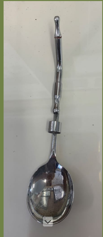
Bacon's Aural syringe without the rubber component has been a "Mystery object" for a number of years.

Attendance at a Health Care Museum such as SPASM allows visitors to reflect on the past, to contrast with the present and contemplate the future.