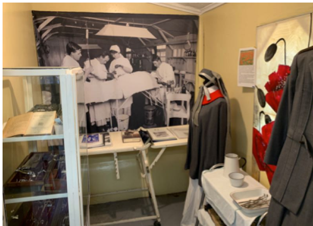
4) WW1 Clearing Station.

The Gladesville room The staff bundy clock, and religious artifacts used at Gladesville during services: a very old bible; church organ & pew. There are photographs and some stories about past patients and attendants, as well as literature about the past history of the asylum.