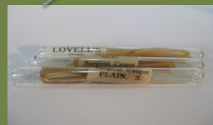
3) Lovell's sutures