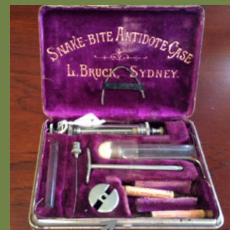
2) Bruck's snakebite Antidote case