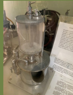
1) Clement's Vapouriser

Attendance at a Health Care Museum such as SPASM allows visitors to reflect on the past, to contrast with the present and contemplate the future.