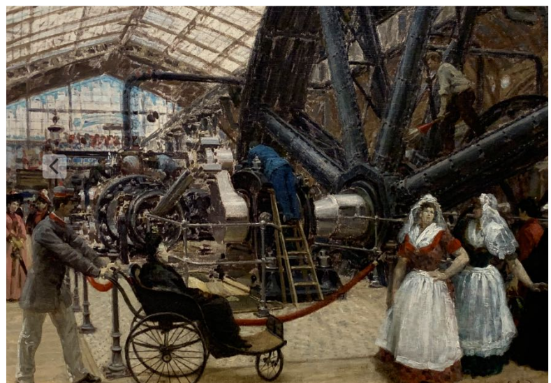
Some of the wonderful art works and displays seen at the Bendigo Art Exhibition this month. Ohhh to have the space to show exhibits like this would be amazing. Full length photographs one could stand in front of and be part of the scene.