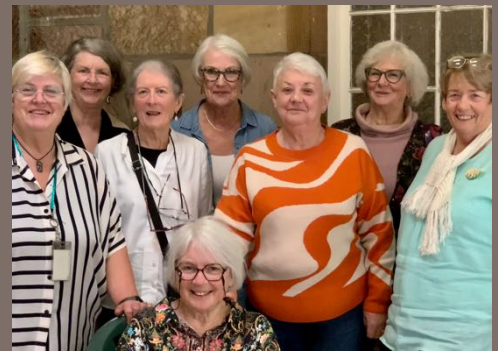
A recent reunion of part of a small group of nurses who commenced nursing at RNSH in 1966 was held at the museum. A great time was had by all.

Contact us if you would like to hold a reunion at the museum. Catering can be provided.