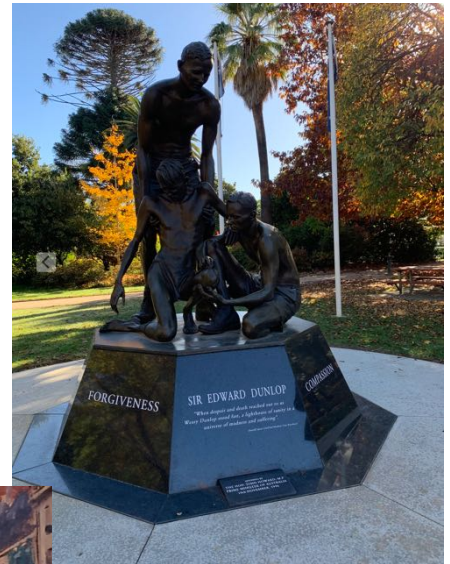
Seen on the way to Bendigo ... to keep to a slightly medical theme .... A Statue commemorating the work of Sir Edward Dunlop at the Benalla Gardens near the Benalla Art Gallery

Then an unexpected road trip, for two of us, to Bendigo to see the exhibition "Paris Impressions of life 1880 – 1925" was organised. We will let the images show how impressed we were.